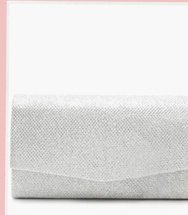
Structured metallic clutch bag & chain Boohoo £12