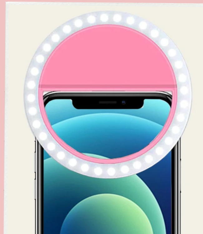
1pc Clip-on Phone Fill Light Shein £1.99