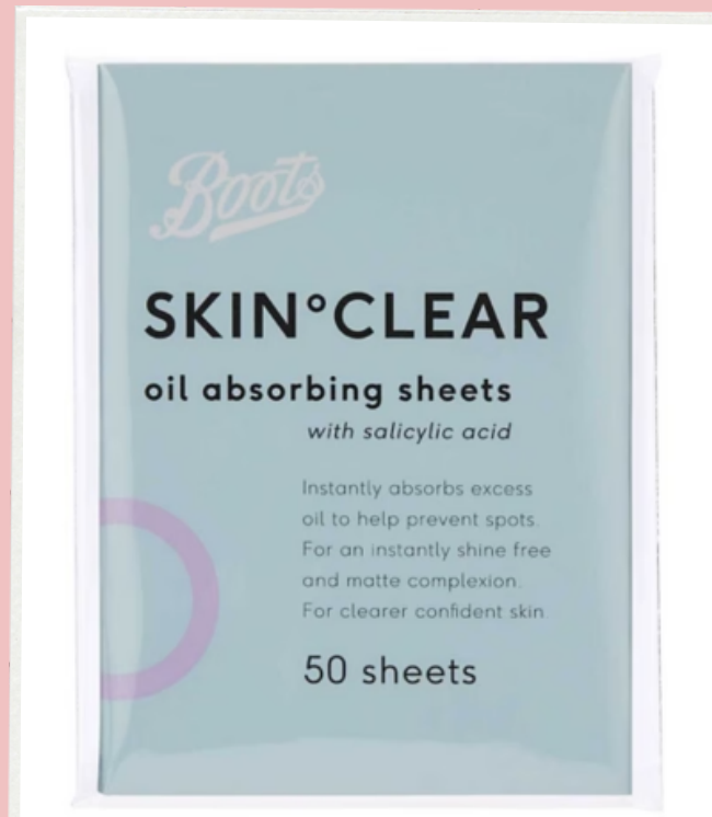
Skin Clear Oil Absorbing Sheets 50pk Boots £4.50