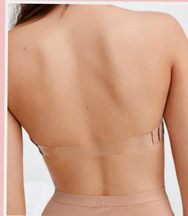
Clear Back Smoothing Multiway Bra Next £16