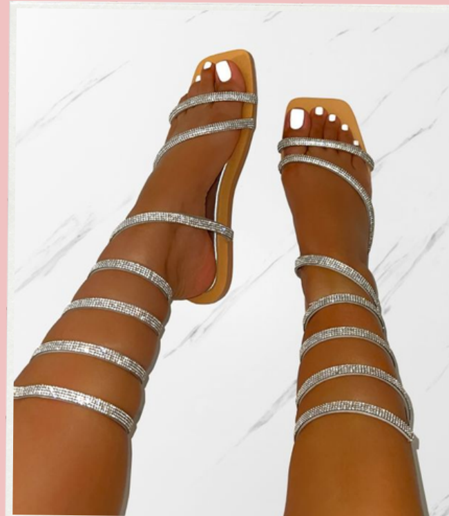
Nashwa silver diamante spiral flat sandals Simmi Shoes £30